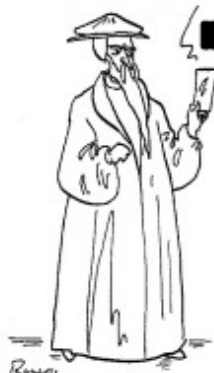
John Calvin's satnav